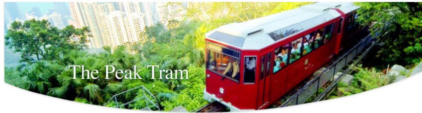
The Peak Tram

The Peak Tram, one of the world's oldest and most famous funicular railways, rises to 396m above sea level. It's so steep that the buildings you pass look like they are leaning as you travel on a gradient of between 4 to 27 degrees!