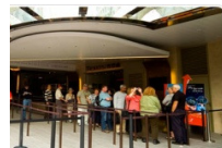
Peak Tram Lower Terminus Ticket Counter

Operating Hours: The Peak Tram 7 am to 12 midnight (Daily) Sky Terrace 428 10 am to 11 pm (Mon - Fri) 8 am to 11 pm (Sat, Sun & Public Holidays)