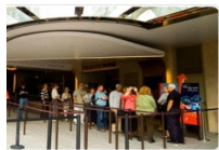
Peak Tram Lower Terminus Ticket Counter

Operating Hours: The Peak Tram 7 am to 12 midnight (Daily) Sky Terrace 428 10 am to 11 pm (Mon - Fri) 8 am to 11 pm (Sat, Sun & Public Holidays)