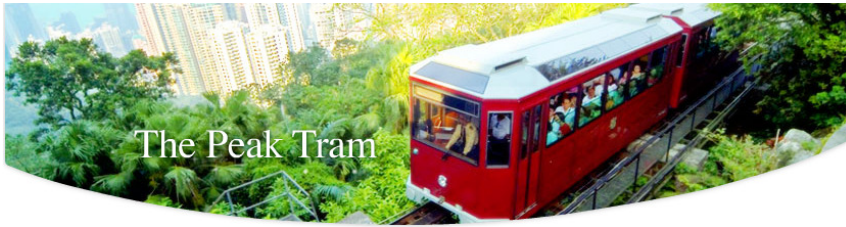
The Peak Tram

The Peak Tram, one of the world's oldest and most famous funicular railways, rises to 396m above sea level. It's so steep that the buildings you pass look like they are leaning as you travel on a gradient of between 4 to 27 degrees!